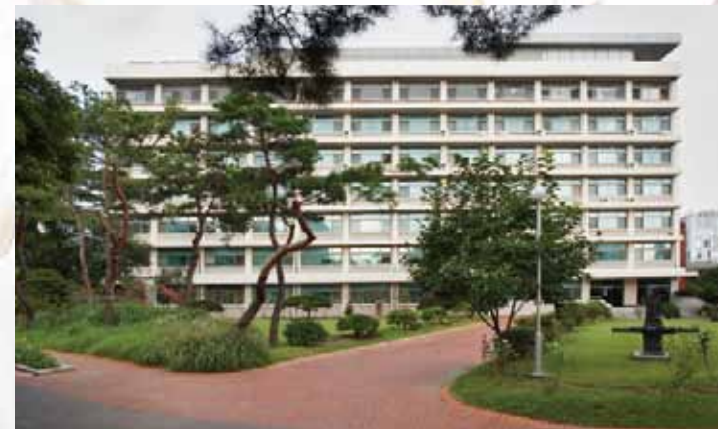
본관 교사 Today's Ewha