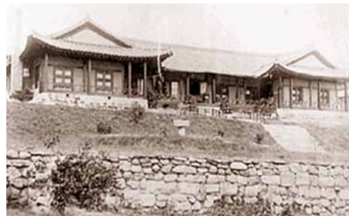
1886년 최초의 이화학당 한옥교사 1886, Ewha's very first school building