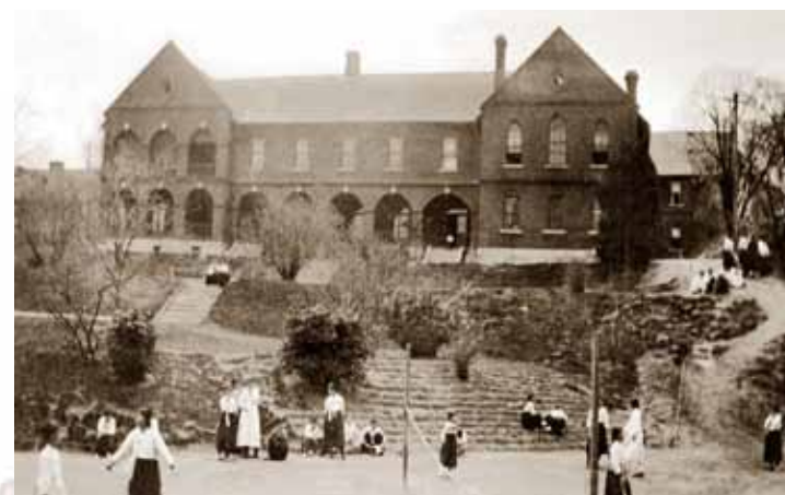
Simpson Hall built in 1915